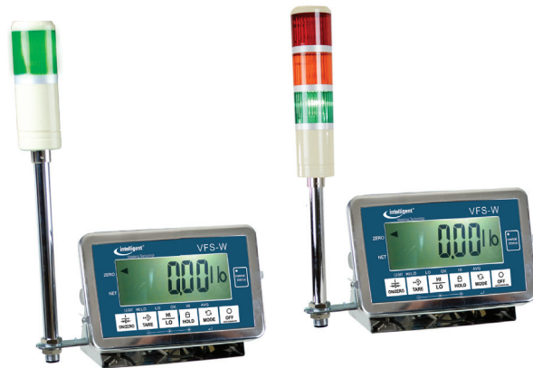
Optional Light Towers One Light Tower Three Light Tower