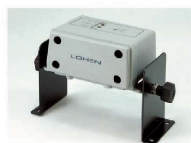
"No wind" Ionizer

* Not available to use in EEA, Switzerland &amp; Turkey.